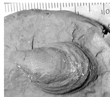
Buchia cf. B. uncitoides (Pavlow)