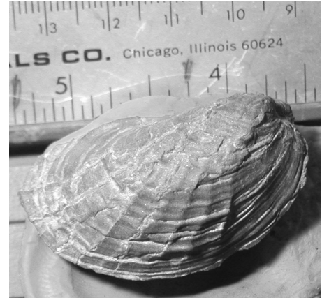
Pholadomya aff. P. subelongata Meek

Lithologic Details: Very fine-grained, medium to dark gray sandstone to silty shale, horizontally bedded with minor cross-beds