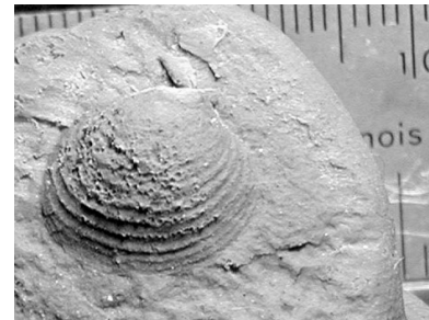
Buchia okensis (Paylow) are present, the sample numbers suggest this may be the case. If this is so, then the identification of B. sublaevis is problematic, because I am firmly convinced that the identification of B. okensis is correct. The specimens in these samples certainly look like B. sublaevis , and I would not question their identity otherwise. However these Buchia are all juveniles, which can be difficult to work with. So I have questioned their identity above. If they are not B. sublaevis , they do not appear to be juvenile B. okensis , but there is a possibility that they are juvenile B. volgensis (Lahusen), which co-occurs with B. okensis . Buchia sublaevis (Keyserling) ? 03 DL 38-2

identification of B. sublaevis is problematic, because I am firmly convinced that the identification of B. okensis is correct. The specimens in these samples certainly look like B. sublaevis , and I would not question their identity otherwise. However these Buchia are all juveniles, which can be difficult to work with. So I have questioned their identity above. If they are not B. sublaevis , they do not appear to be juvenile B. okensis , but there is a possibility that they are juvenile B. volgensis (Lahusen), which co-occurs with B. okensis .