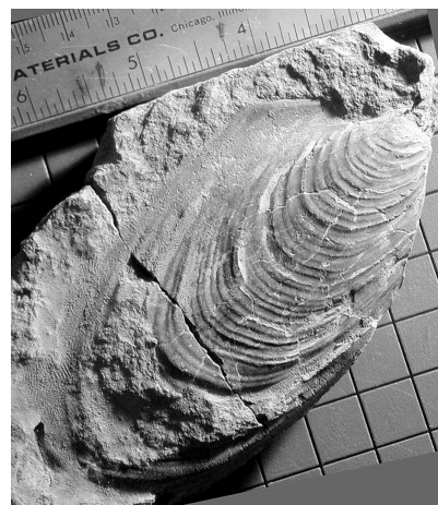
Mytiloides mytiloides (Mantell)

Lithologic Details: Very fine-grained, dark gray sandstone, parallel bedded, non-graded, laterally continuous