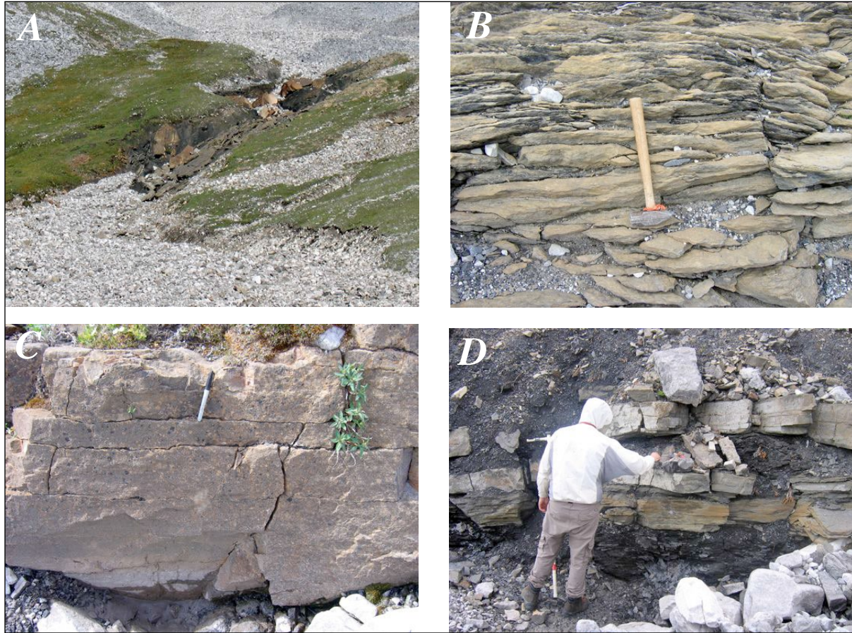
Figure 4. Kayak Shale at May Creek (loc. 1, fig. 1). A, Overview, looking downhill to northeast. B, Thin-bedded, yellow-orange-weathering, argillaceous limestone ~1 m above base of measured section (abs). C, Thin- to thick-bedded, orange-weathering pelmatozoan grainstone with bryozoans and brachiopods, 17 m abs. D, Interbedded dark-gray calcareous shale and yellow- to orange-weathering wacke-packstone, 19–21 m abs.