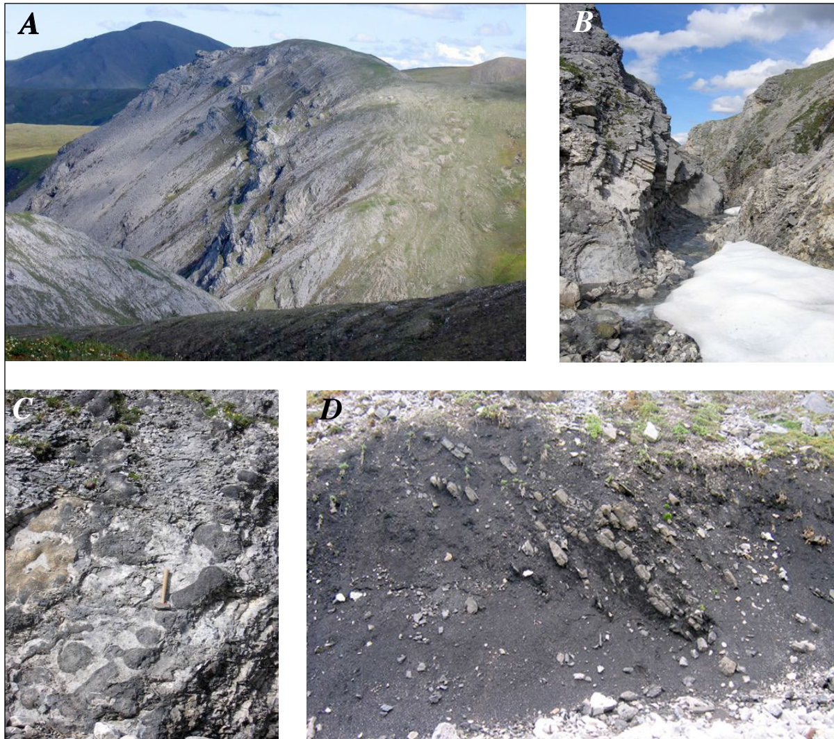
Figure 6. Upper Lisburne Group (A–C) and overlying Permian strata (D) at West Peregrine Creek (loc. 4, fig. 1). A, Overview, looking northeast. B, Closer view, looking north. C, Large chert nodules in lime mudstone to wackestone. D, Dark-gray shale with abundant carbonate concretions.

Lisburne at this locality are of late early Morrowan (Early Pennsylvanian) age and have color alteration indices (CAIs) of 3.5–4 (Siok, 1985).