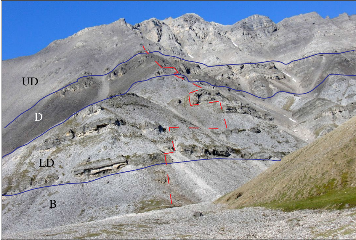
Figure 3. Lower part of the Lisburne Group at May Creek (loc. 1, fig. 1); traverse of measured section (fig. 2) shown by dashed red line. Letters indicate informal units described in text: B, basal unit; LD, lower dolomitic unit; D, dark-weathering unit; UD, upper dolomitic unit. Kayak Shale at base of measured section is out of sight in gully near base of photo.

mosaics (crystals chiefly 0.15–>0.5 mm diameter) that contain relict, partly calcitic pelmatozoan ossicles (to 1 cm diameter) and lesser bryozoan fronds; some beds are completely dolomitized. Textures indicate a pelmatozoan grainstone protolith for these strata. Millimeter-scale vuggy porosity (1–5 percent) occurs in a few samples, but most vugs are filled with sparry calcite. Muddier intervals are lime mudstone to wacke-packstone in 2- to 10-cm-thick, locally nodular beds with 20–50 percent black chert lenses and nodules and minor, disseminated small dolomite rhombs (fig. 5C). Bioclasts in these beds are mainly bryozoan and pelmatozoan fragments, with lesser ostracodes and calcareous sponge spicules.