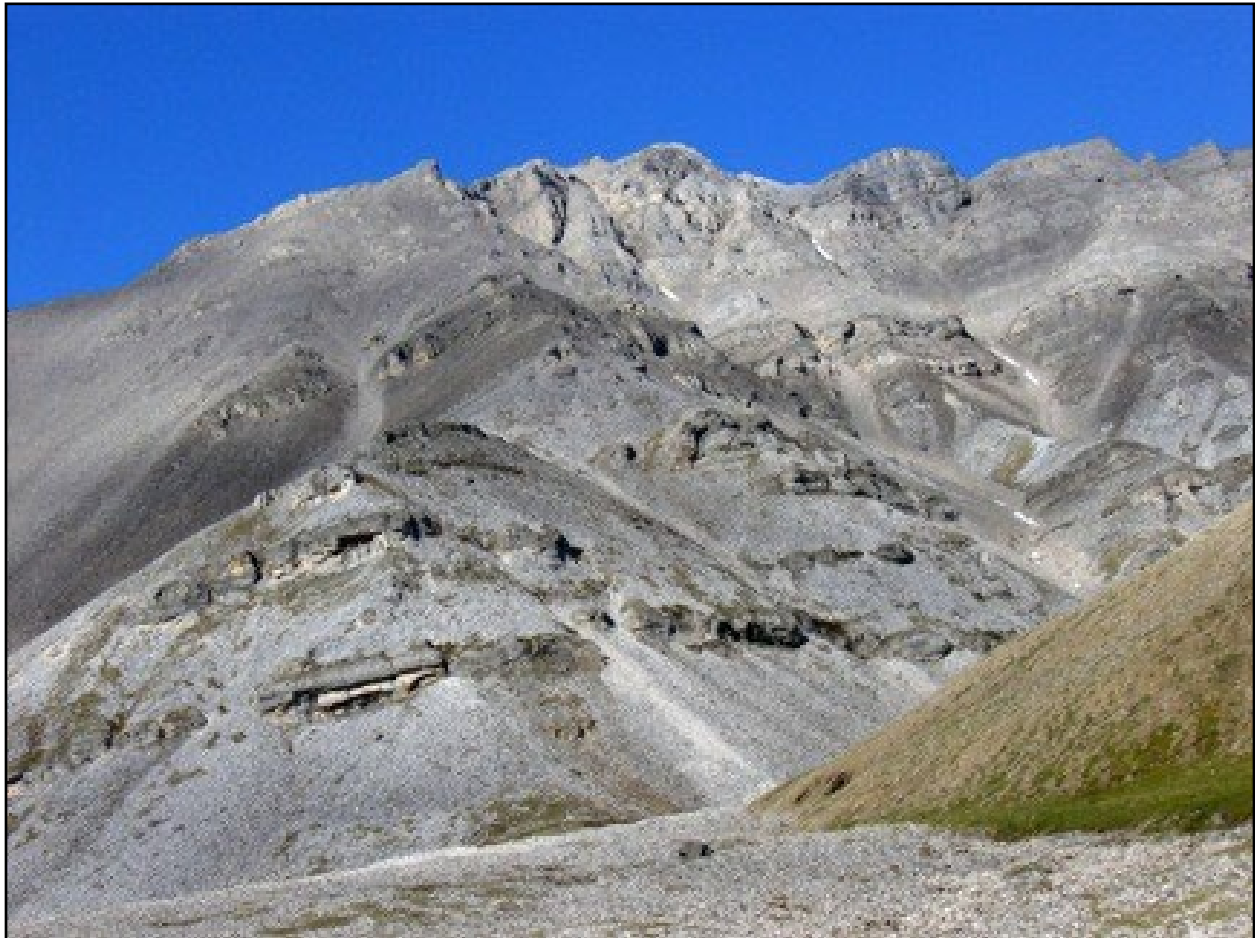
Lower part of the Lisburne Group at May Creek, eastern Chandler Lake Quadrangle.